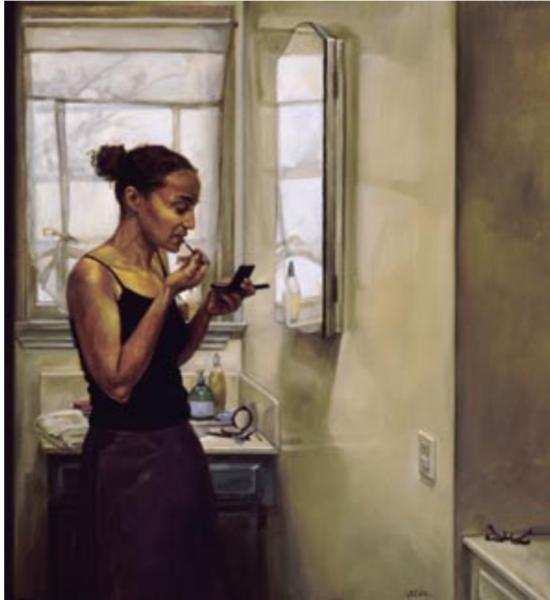
Prepare , 2006 22 x 22 inches oil on panel