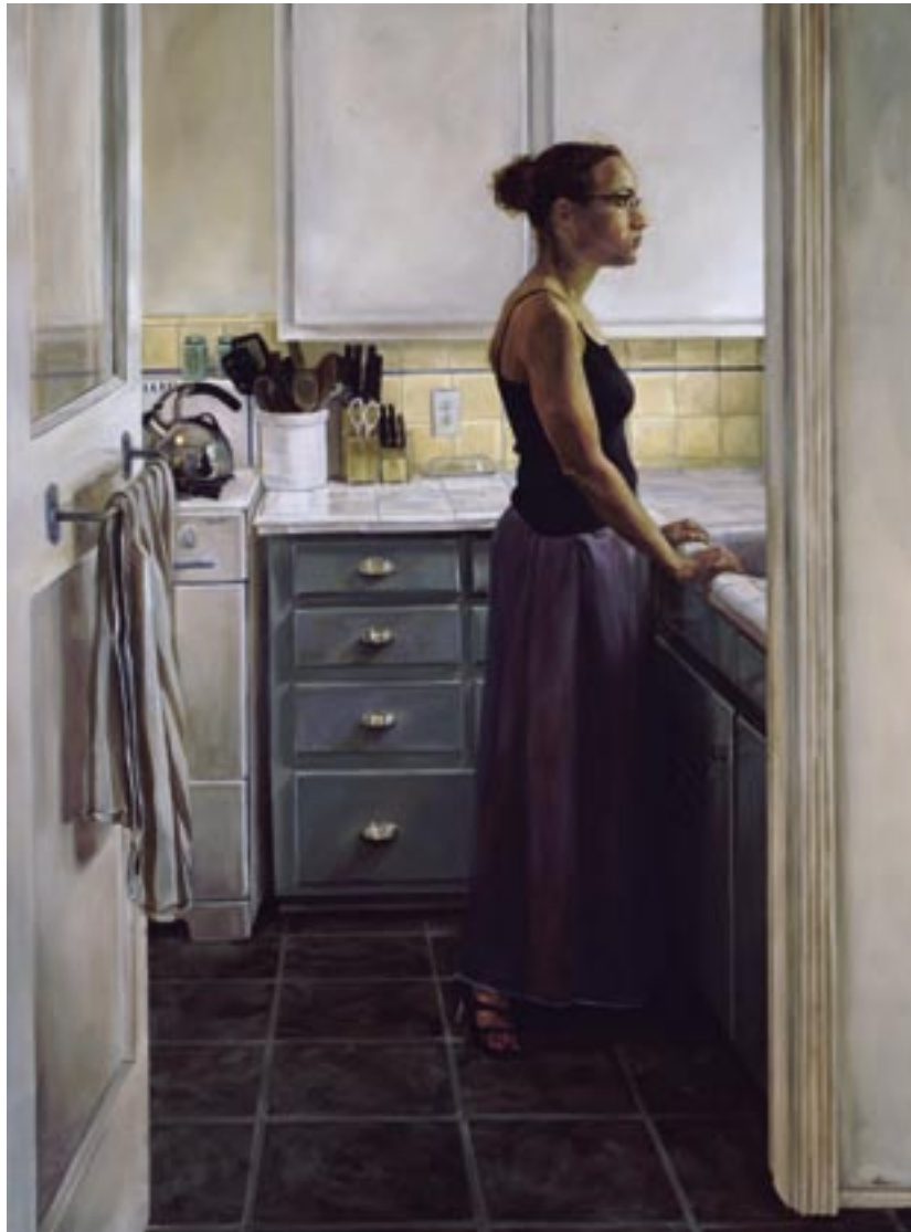
ABOVE: Kitchen Window , 2006 48 x 36 inches oil on panel