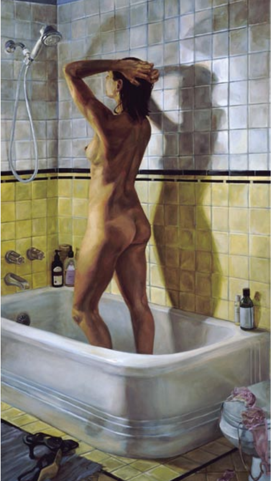
ALIA E. EL-BERMANI / perceptions of beauty