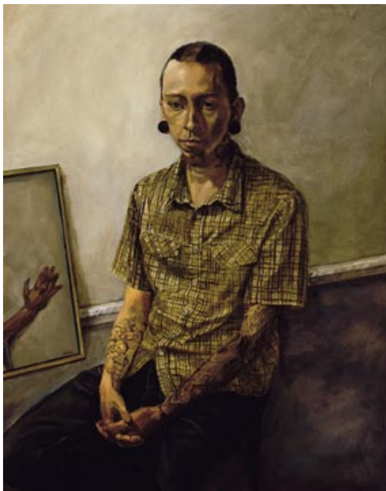
Colin , 2006 20 x 16 inches oil on panel