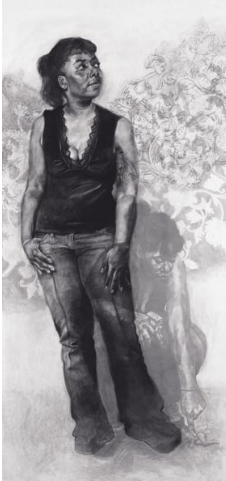
Plurality , 2004 72 x 64 inches charcoal on vellum