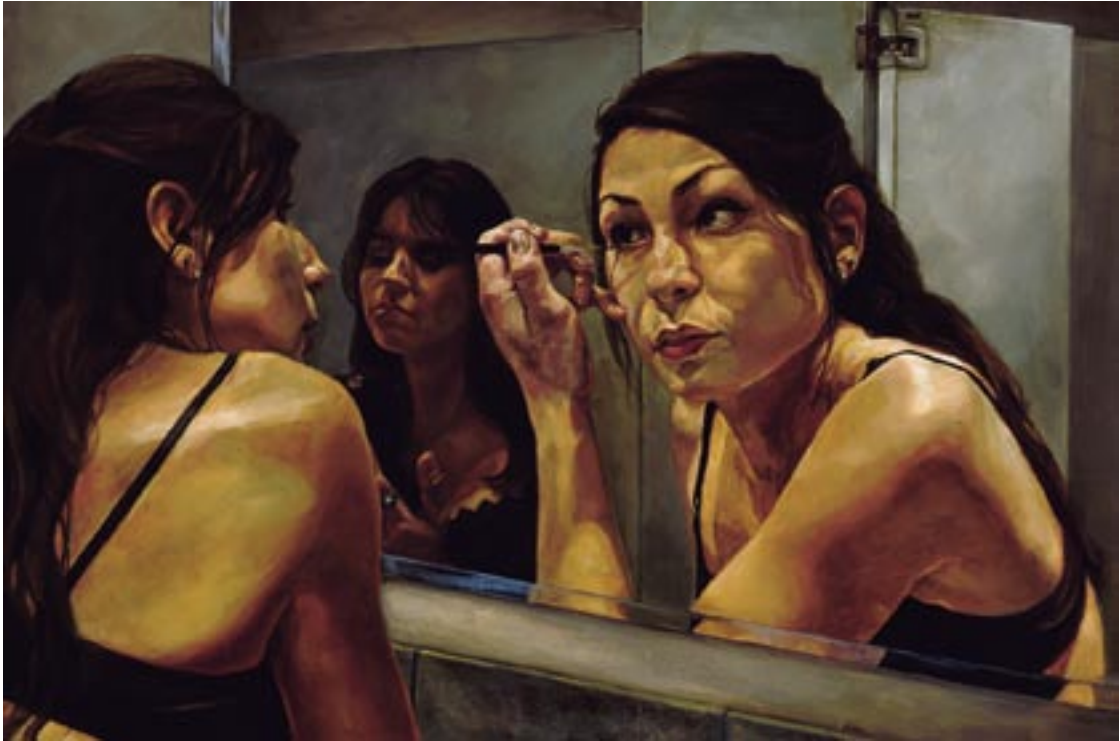
Public Restroom, 2006