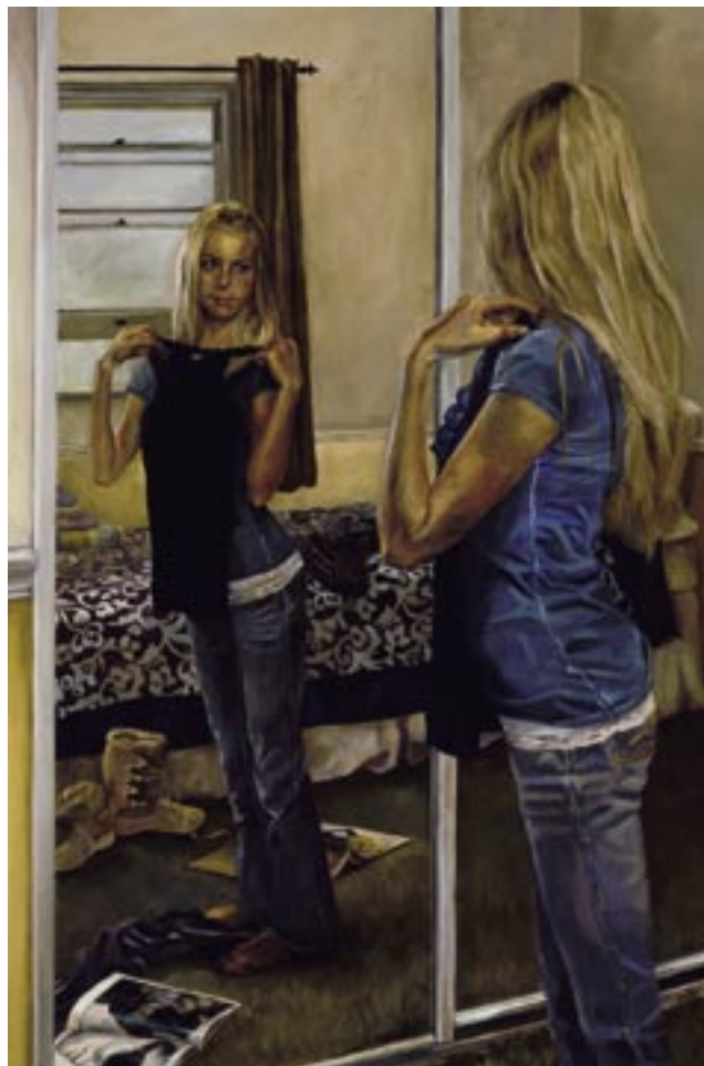
Reflecting Image , 2006