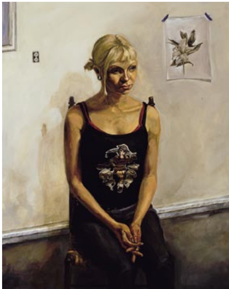
Alison , 2006 20 x 16 inches oil on panel