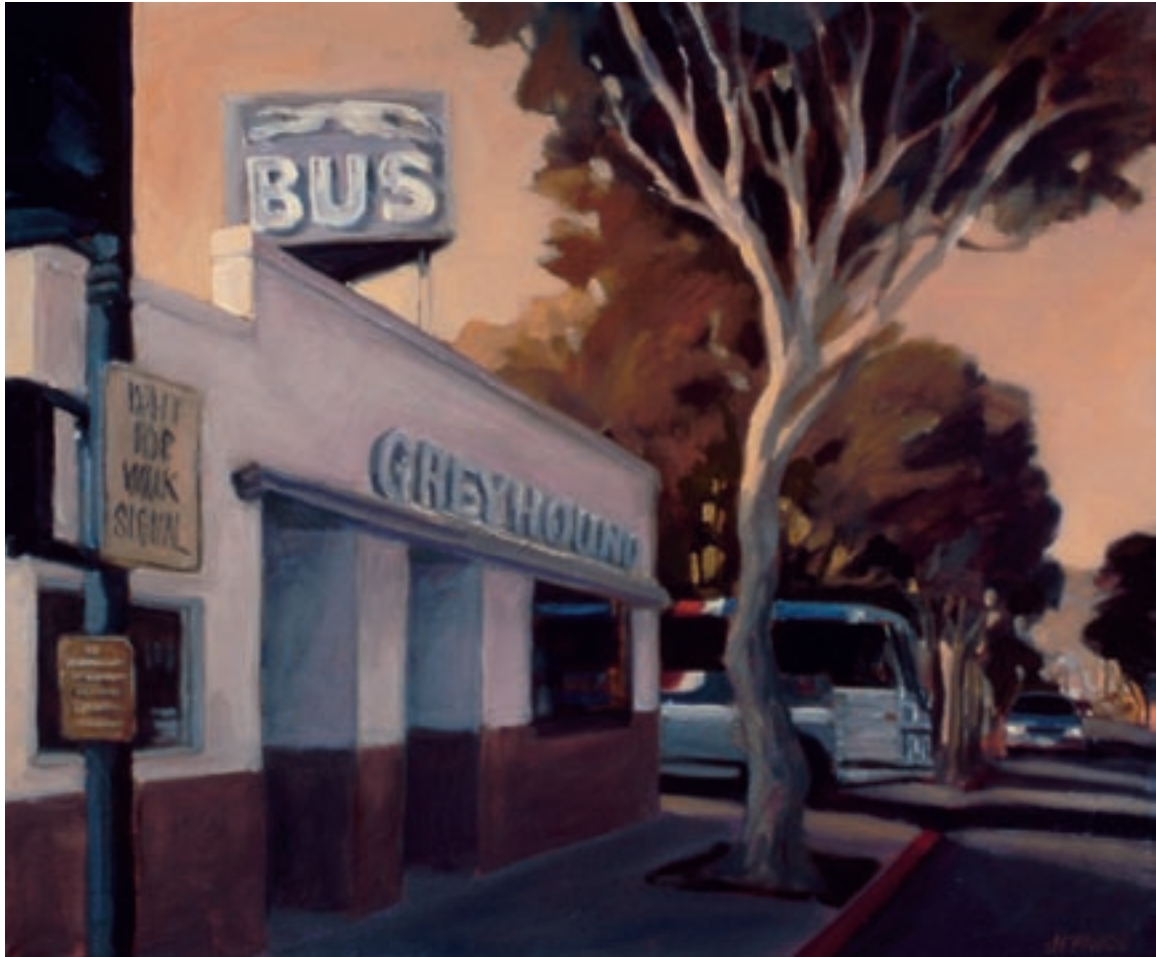
LAST BUS TO LOMPOC, 2004 | 20 X 24 INCHES | OIL ON CANVAS