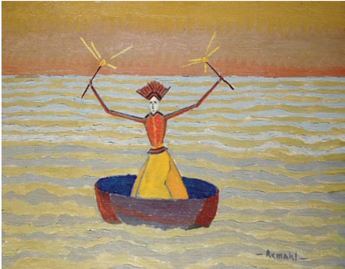
DIVINE PASSION IN YELLOW AND ORANGE, 1930 | 14 X 18 INCHES | OIL ON CANVAS