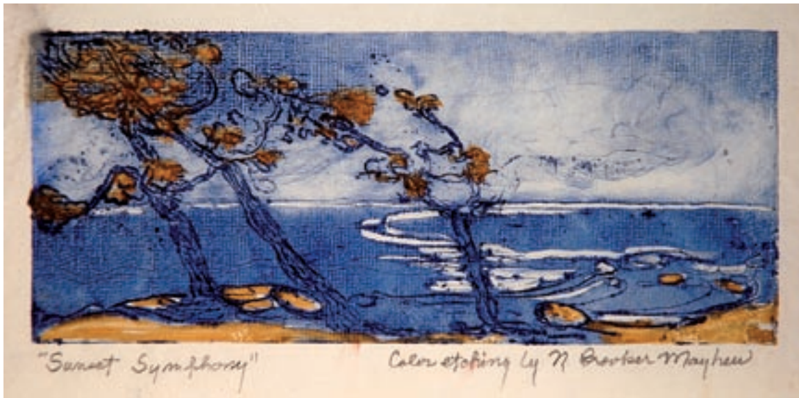
SUNSET SYMPHONY, ND | 5 X 10 INCHES | ETCHED MONOTYPE

Sullivan Goss - An American Gallery and Balcony Press are excited to announce a new book: