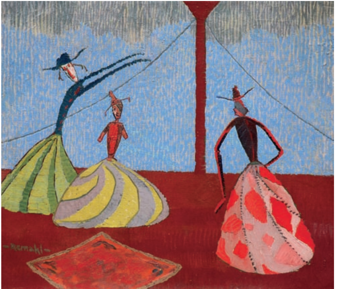
THREE DOLLS IN TENT, 1930 | 18.5 X 21 INCHES | OIL ON CANVAS