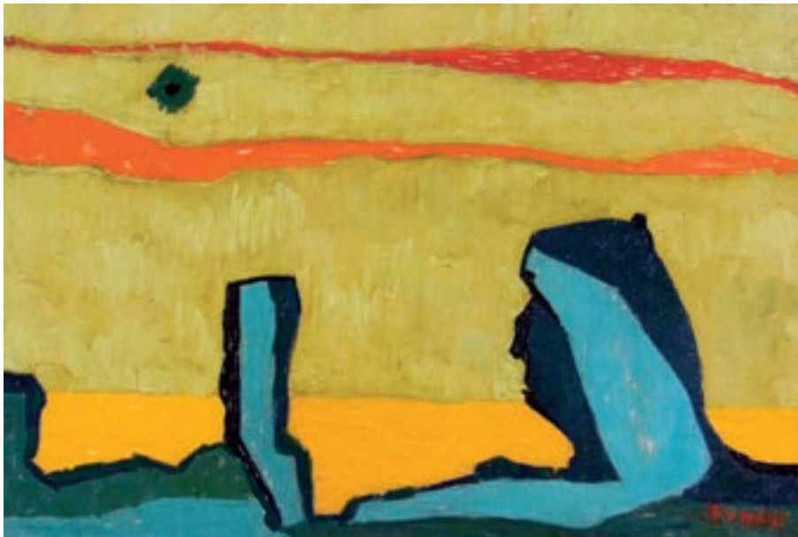
YELLOW SEA AND BLUE SUN, c. 1940 | 12 X 18 INCHES | OIL ON CANVAS