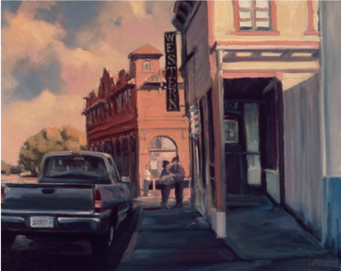
LET'S DANCE, 2005 | 20 X 30 INCHES | OIL ON CANVAS