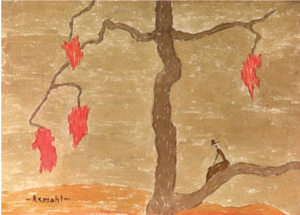
FOUR ORANGE LEAVES, c. 1950s | 9.5 X 13.5 INCHES | WATERCOLOR ON PAPER