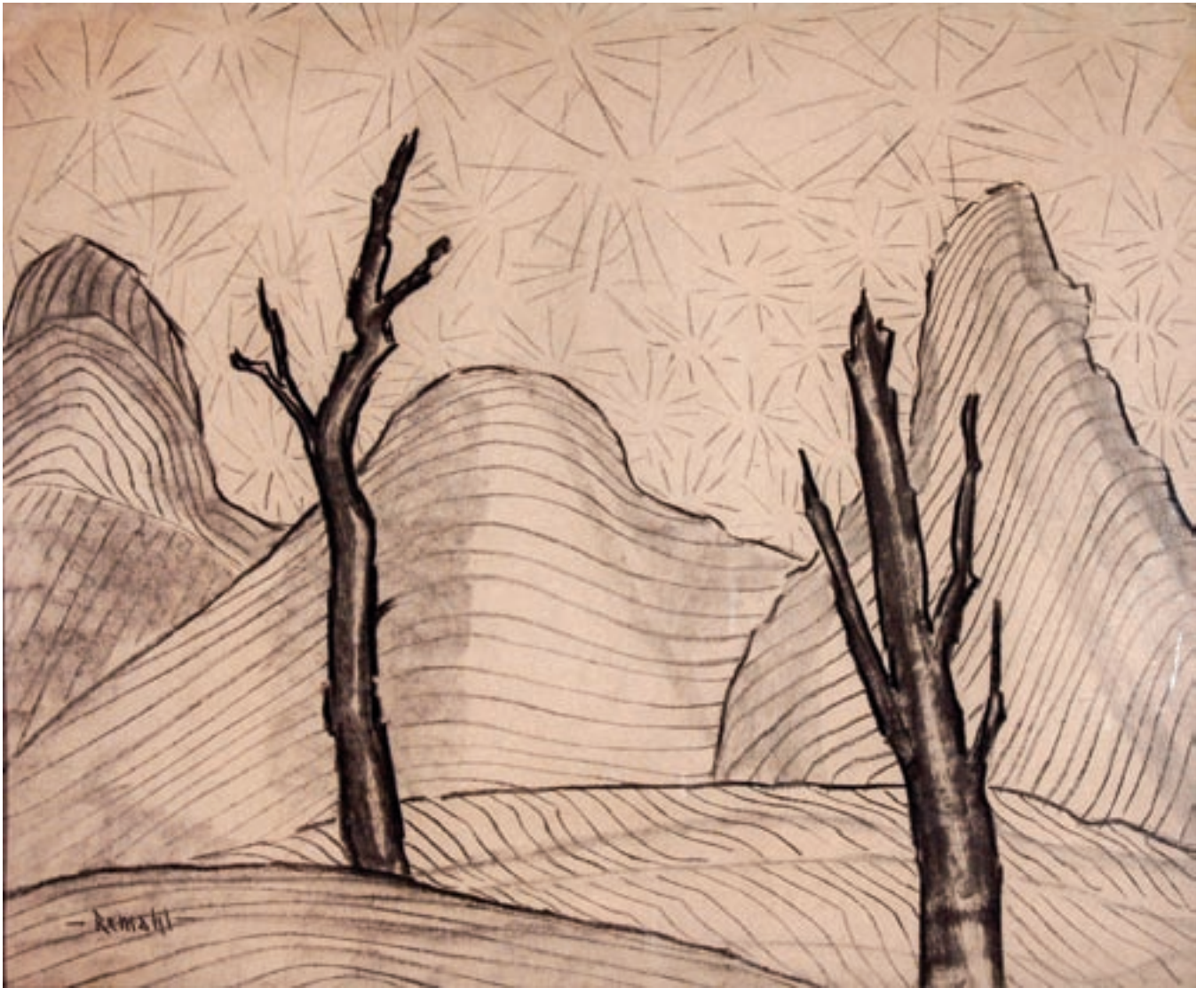
MODERNIST SCAPE - FR65, ND | 19 X 23 INCHES | CHARCOAL ON PAPER