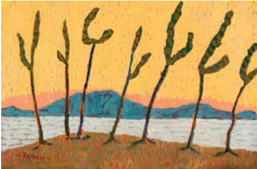
SEVEN TREES, 1938 | 12 X 18 INCHES | OIL ON CANVAS