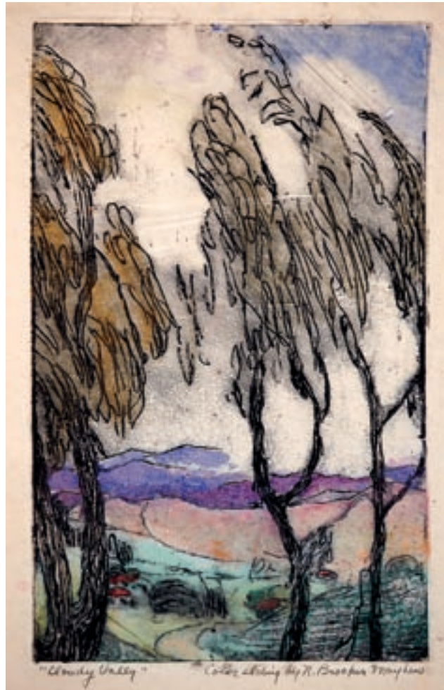
CLOUDY VALLEY, ND | 14 X 9 INCHES | ETCHED MONOTYPE