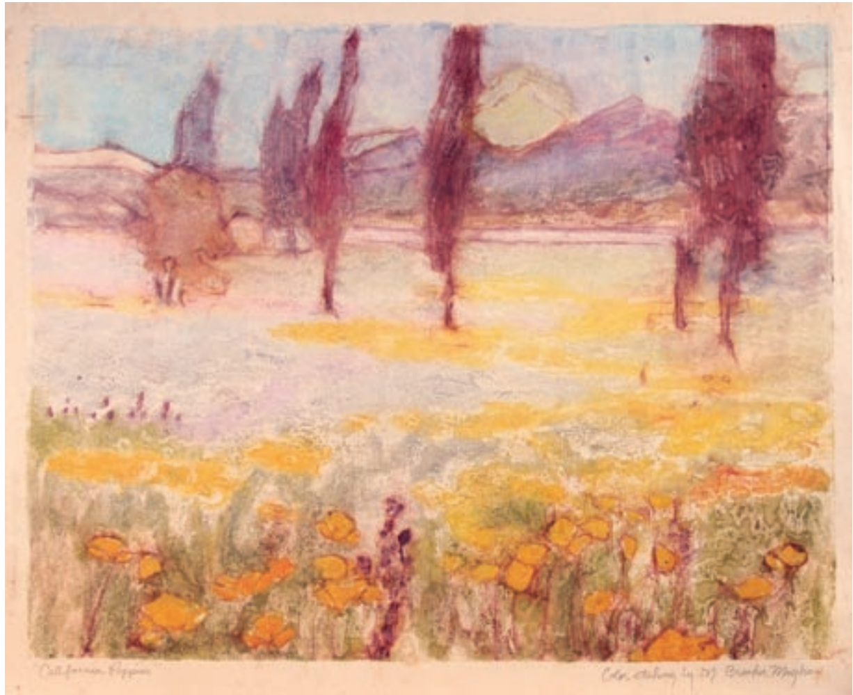
CALIFORNIA POPPIES, c. 1915 | 15.5 X 19 INCHES | ETCHED MONOTYPE