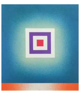
165652 JONSON, RAYMOND. Polymer No. 26, 1974 30 x 27 inches | Acrylic on board Signed lower center