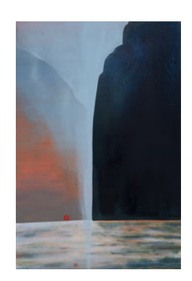
165599 RENDON, MARIA. Y que venga la calma, 2023 36 x 24 inches | acrylic on flashe on Signed on back