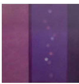
164554 WINFIELD, CHRIS. Untitled, c. 2018 24 x 24 inches | Acrylic on canvas Signed on back