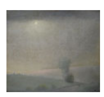
157101 DABO, LEON. Sun and Mist, New Milford (AKA Moonlight at New 30 x 34 inches | Oil on canvas Signed lower right