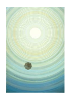
165596 FISCHINGER, OSKAR. Centrifuge, c. 1957 41 x 27 inches | Oil on board Signed lower right