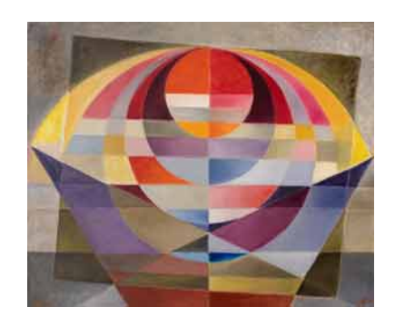
165650 DREWES, WERNER. Enfolding, 1984 36 x 44 inches | Oil on canvas Signed lower left