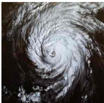
165602 PAZDERKA, TOM. Ex Nihilo, 2023 40 x 40 inches | Ash, charcoal, oil on