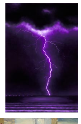
165600 ARNOLDI, NATALIE. Break, 2023 36 x 24 inches | Oil on canvas Signed on back