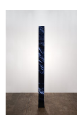
165661 RASMUSSEN, ALEX. Equinox, 2023 78 x 6 x 2.5 inches | Anodized Signed on back