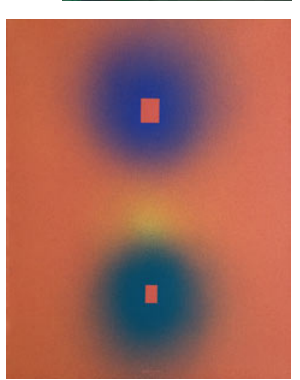
165665 JONSON, RAYMOND. Polymer No. 12, 1967 30 x 24 inches | Acrylic on board Signed lower center