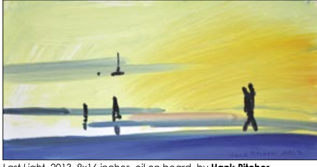
Last Light, 2013, 8x16 inches, oil on board, by Hank Pitcher

all, with the mural Spring as a focal point. "The title of this exhibition refers to the horizontal format," Pitcher noted. "One of these paintings [Spring] is 17 feet wide. It is peripheral but also involves space near and far away. I think this comes partially a few other people in the water. I needed and wanted to be aware of what was going