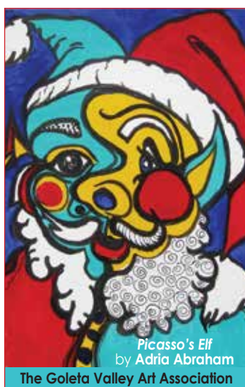
The Goleta Valley Art Association 10th Annual Picassos 4 Peanuts Virtual Show & Sale All work $300 or less • Through March TheGoletaValleyArtAssociation.org