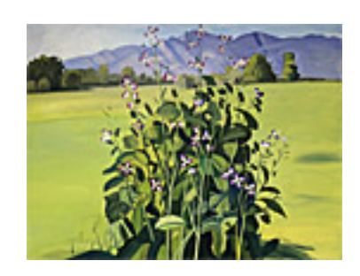
161301 PITCHER, HANK. Wild Radish, 2018 36 x 48 inches | Oil on canvas over Signed lower left