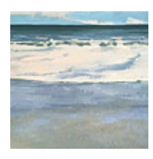
159921 STRASBURG, NICOLE. Spring Shoreline, 24 x 24 inches | Oil on birch panel Signed on back