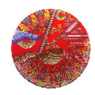
161315 COOLEY, DAVID. Cusp, 2018 24 x 24 inches | Mixed media on Signed