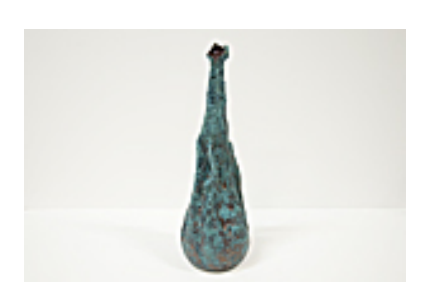
161341 HAGGERTY, JAMES. Vita Nova #3, 2018 18 x 7 x 7 inches | Ceramic Signed