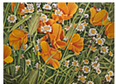
161294 CHURCHILL-JOHNSON, DOROTHY. Roadside in March, 54 x 72 inches | Oil on canvas Signed on back