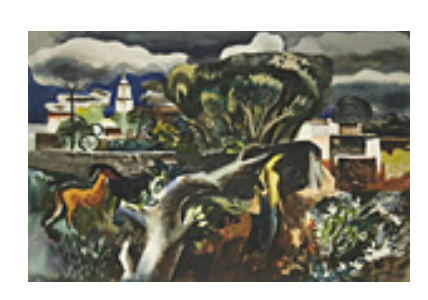
161248 SHEETS, MILLARD. New Mexico, c. 1944 15 x 22 inches | Watercolor on Signed lower left