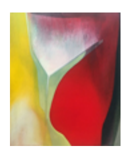
161300 RENDON, MARIA. Five Minutes Til Midnight, 2018 17 x 14 inches | Acrylic on panel Signed on back