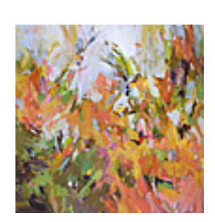
161302 CONNALLY, CONNIE. Summer Tangle, 2018. 30 x 30 inches | Oil on canvas Signed