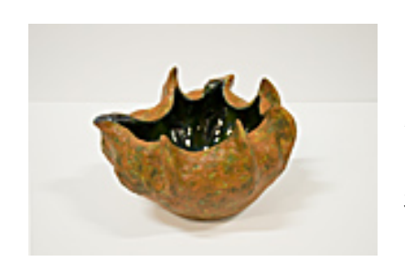
161342 HAGGERTY, JAMES. Mare Creaturae #1, 2018 7 x 9 x 9 inches | Ceramic Signed