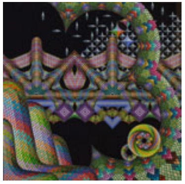
161892 COOLEY, DAVID. Untitled, 2018 36 x 36 inches | Mixed media on Signed