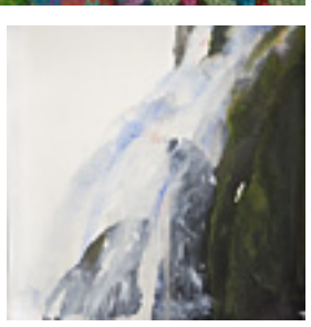
160820 GOLDYNE, JOSEPH. SMALL FALL 4, 2016/17 7 x 7 inches | Mixed media on paper Signed lower center