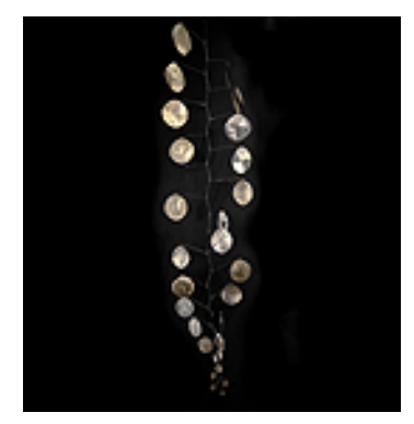
161334 NOT FOR SALE BORTOLAZZO, KEN. Cluster, 2017 70 x 20 x 20 inches | Stainless steel