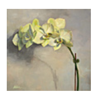
159914 EL-BERMANI, ALIA. White Orchid, 2015 12 x 12 inches | Oil on panel Signed lower left