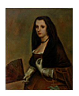
160110 SERISAWA, SUEO. Portrait of Lady with Fan, c. 1930s 24 x 20 inches | Oil on canvas. Unsigned.