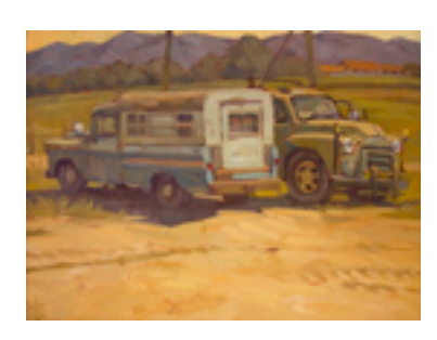
162121 ABBOTT, WHITNEY BROOKS. 2 GMCs, 18 x 24 inches | Oil on canvas Signed lower left