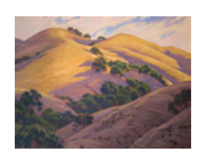
162126 ON HOLD COMER, JOHN. Golden Hills with Live Oaks, 36 x 48 inches | Oil on canvas over Signed lower right