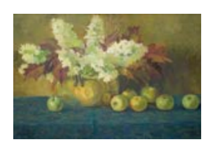
162023 ABBOTT, MEREDITH BROOKS. Oak Leaf Hydrangea, 2014 24 x 36 inches | Oil on canvas Signed lower left