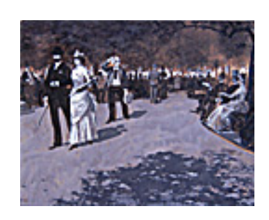
113220 LUNGREN, FERNAND. Central Park Promenade, 1888 16 x 20 inches | Gouache on board Signed LR