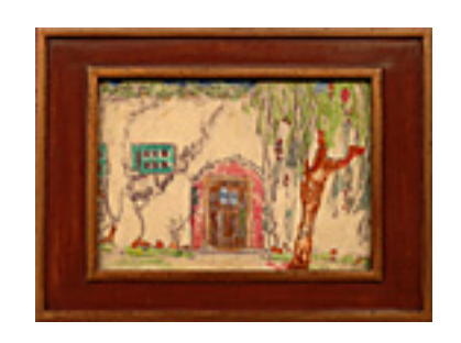
113857 MAYHEW, NELL BROOKER. Adobe with Four-Light Doors, 9.75 x 13.75 inches | Etched