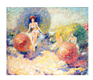
114027 CLAPP, WILLIAM HENRY. Sitting by the Sea, 1948. 16 x 20 inches | Oil on board. Signed LR.