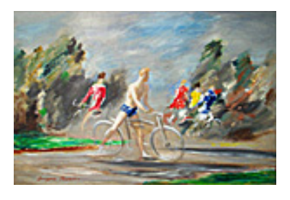
151710 PARSHALL, DOUGLASS. Bicycle Race, 1949 20 x 30 inches | Oil on board