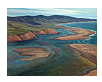
114005 STRONG, RAY. Drake's Estero, Late 1950's. 22 x 28 inches | Oil on canvas. Signed lower left.