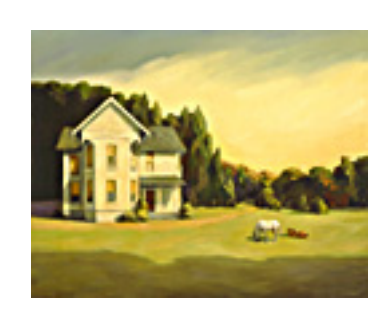
114473 STORCH, SALLY. In My Pasture, 2003. 24 x 30 inches | Oil on canvas. Signed lower right.