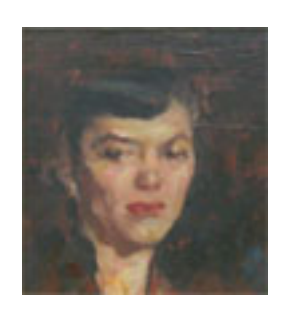
113920 FOSTER, WILLIAM FREDERICK. Dark Haired Woman, circa 1940 9 x 9.5 inches | Oil on canvas over Unsigned

ENGLEHARD, JOSEPH JOHN. Yosemite Valley, California, Circa 1910. 12 x 18 inches | Oil on board.