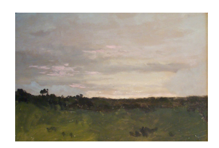
108577 DE FOREST, LOCKWOOD. Santa Barbara: Dawn, ND. 9.75 x 14 inches | Oil on board. Unsigned.