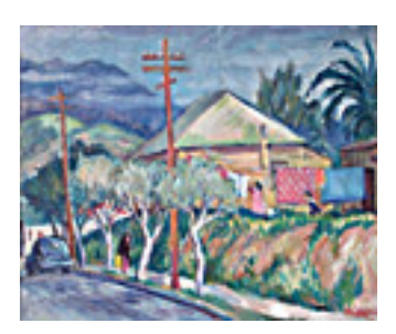
113334 NOT FOR SALE FREEMAN, DON. The Artist's House, 19.5 x 23.25 inches | Oil on canvas Signed lower right