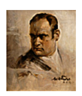
113921 FOSTER, WILLIAM FREDERICK. Portrait of Dressed Gentleman, Circa 1930. 14 x 12 inches | Oil on canvas. Signed.