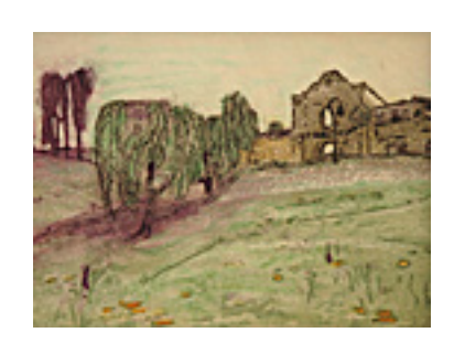
113838 MAYHEW, NELL BROOKER. San Diego de Alcala, 10.75 x 14.5 inches | Etched