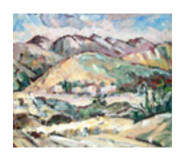
112758 VOLLMER, GRACE LIBBY. Valley and Mountains, 1930. 20 x 24 inches | Oil on Board Signed lower left