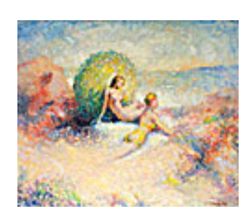
114026 CLAPP, WILLIAM HENRY. Staring at the Sea, 1948. 16 x 20 inches | Oil on board. Signed lower right.

CLAPP, WILLIAM HENRY. Garden Bather and Companion, 10 x 14 inches | Oil on canvas over Unsigned.