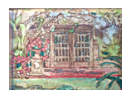
114009 MAYHEW, NELL BROOKER. California Doorway, 9.5 x 13.25 inches | Etched Signed lower left.

MAYHEW, NELL BROOKER. California Doorway, 9.5 x 13.25 inches | Etched Signed lower left.