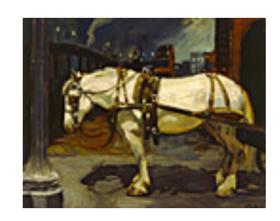
114175 STORCH, SALLY. City Horse before Dawn, 2003. 16 x 20 inches | Oil on canvas. Signed lower right.