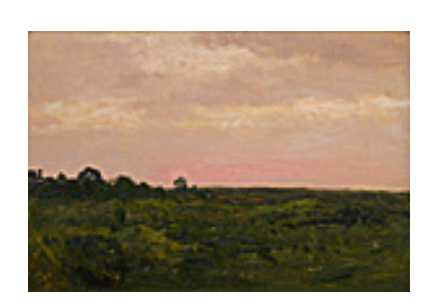
108514DE FOREST, LOCKWOOD.Santa Barbara: Mauve Sunset, Dated but illegible.9.75 x 14 inches | Oil on board.Signed lower right.