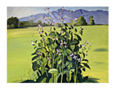
161301 PITCHER, HANK. Wild Radish, 2018 36 x 48 inches | Oil on canvas over Signed lower left