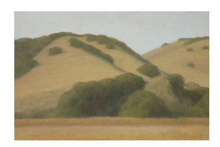
150447 VEDDER, SARAH. The Gold Hills, 2006. 24 x 36 inches | Oil on linen. Signed lower left.