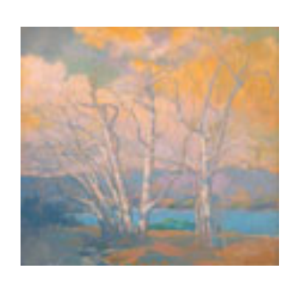
112463 MCGLYNN, THOMAS. Fall Sycamores, c. 1930s 36 x 34 inches | Oil on canvas Signed lower right