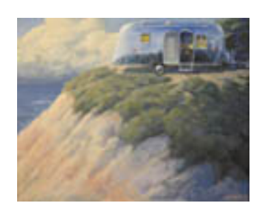
162015 FRANCIS, JON. The View, 2019 16 x 20 inches | Oil on canvas Signed lower right