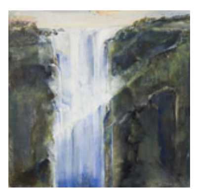
161717 GOLDYNE, JOSEPH. SMALL FALL II, 2005 12 x 12 inches | Mixed media on canvas Signed