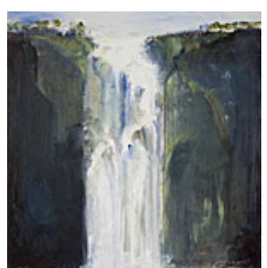
161718 GOLDYNE, JOSEPH. SMALL FALL III, 2005 12 x 12 inches | Mixed media on canvas Signed