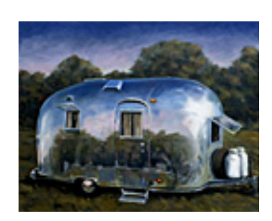
160643 FRANCIS, JON. Last Light, 2017 16 x 20 inches | Oil on canvas Signed